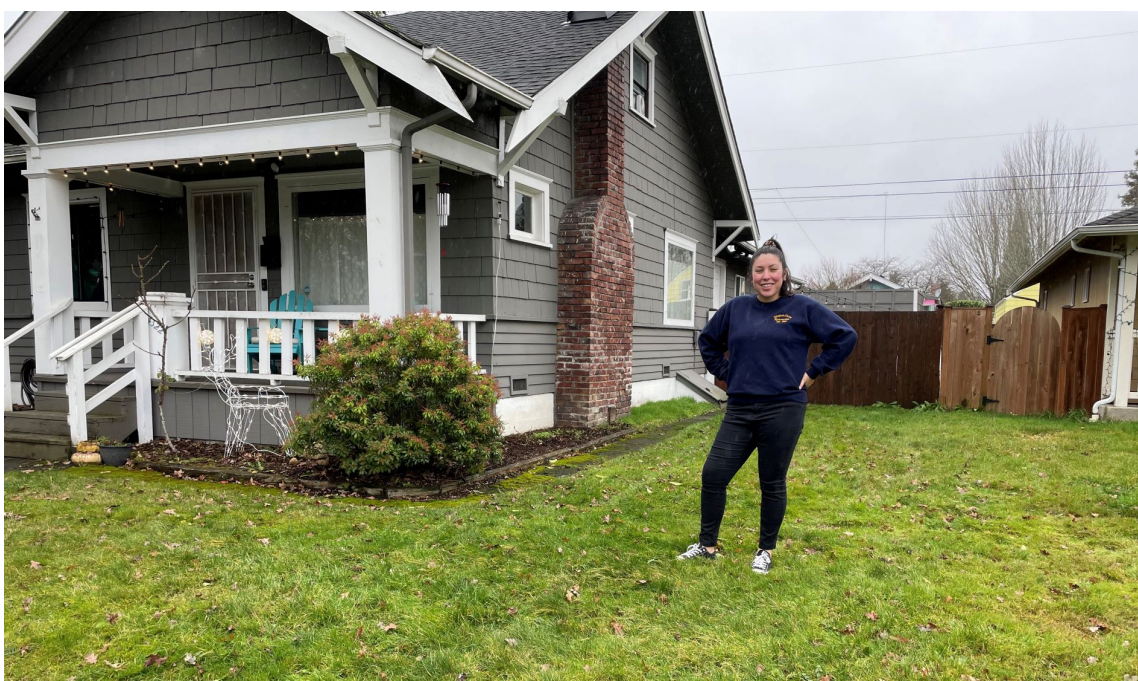
A mini-grant recipient stands on top of her future rain garden.

As the 2022 gets underway, the Pierce Conservation District (PCD) is planning for a greener future in the new year. After receiving over sixty applications for the new Green Stormwater Mini-Grant , PCD is pleased to award $60,000 to sixteen projects in Pierce County's most urban watersheds . In 2022, PCD will work with grant recipients to plant seven rain gardens, remove 1,200 square feet of pavement, convert 5,000 square feet of lawns into urban wildlife habitat, and install five rain tanks to harvest rainwater. Combined, these projects are expected to keep 2 million gallons of polluted stormwater runoff out of the environment every year.