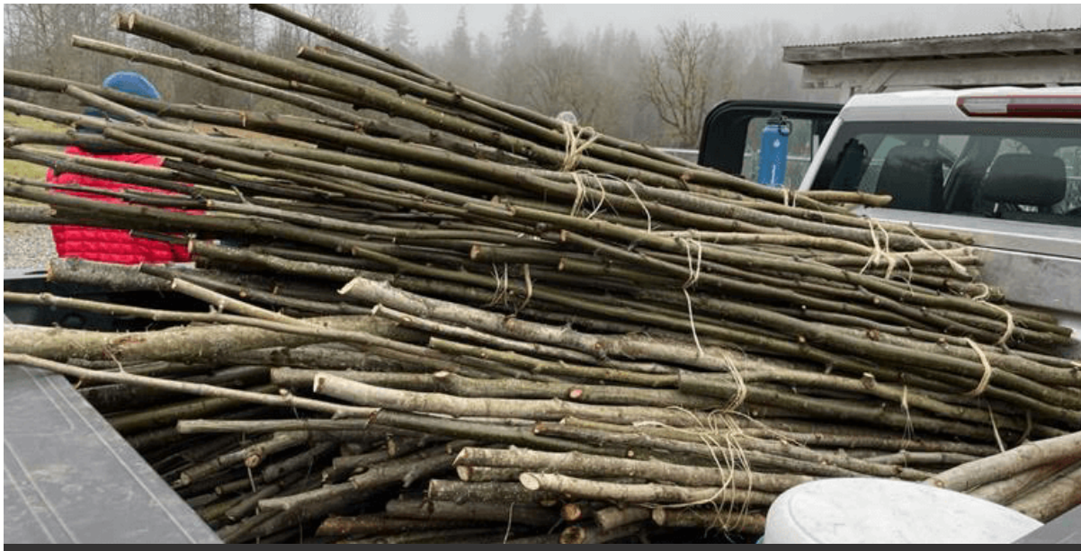
Willow live stakes used to restore wildlife habitat at South Prairie Creek Preserve