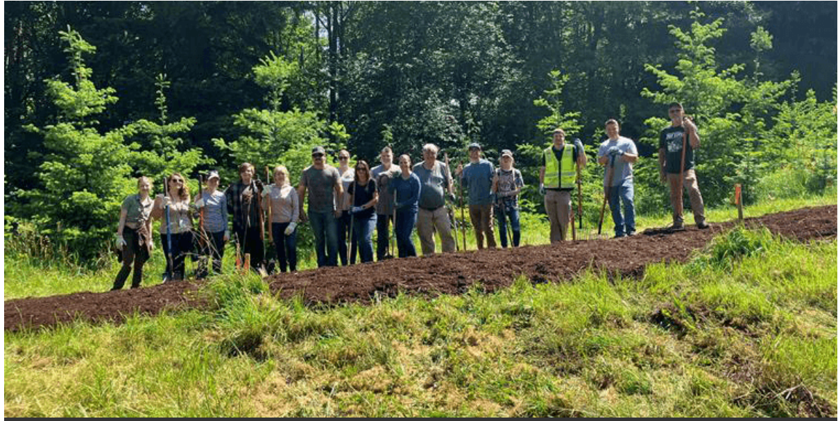
Volunteers proudly show off a newly planted strip at Dead Man's Pond.