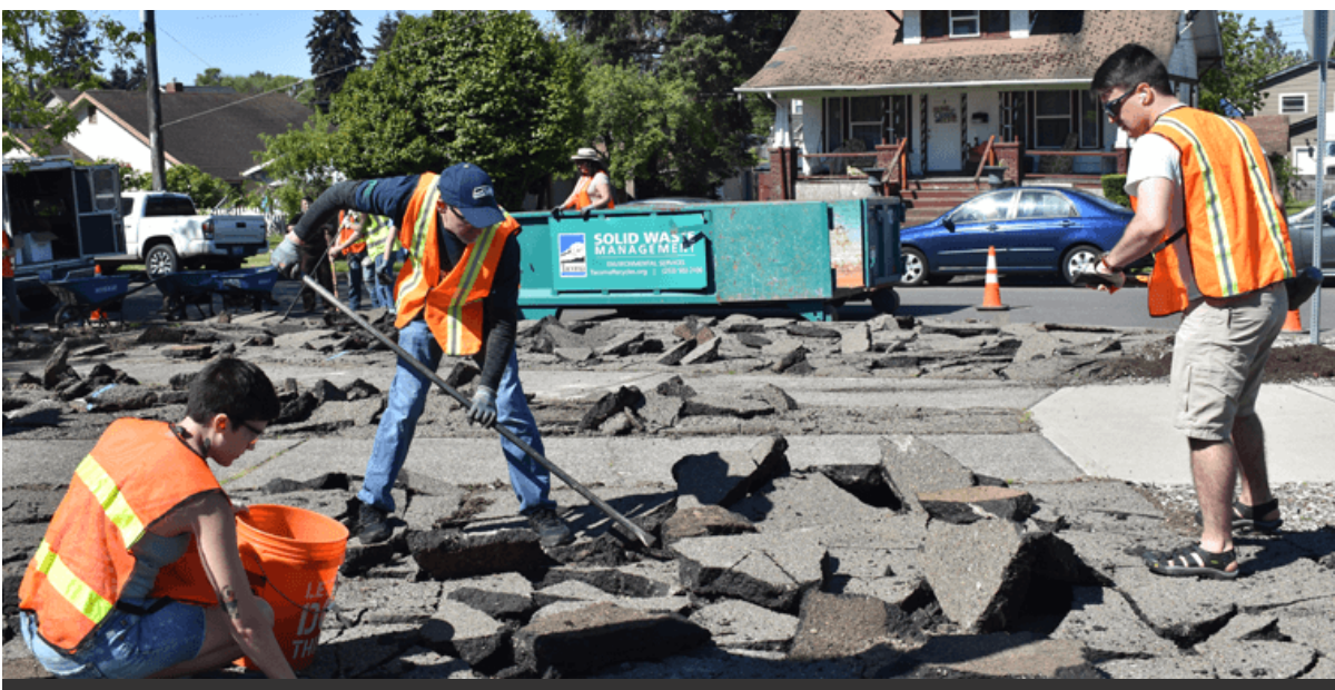
Volunteers demonstrating depaving in action