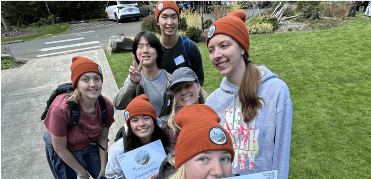
Puyallup High School Envirothon Team celebrates their win at the regional competition.